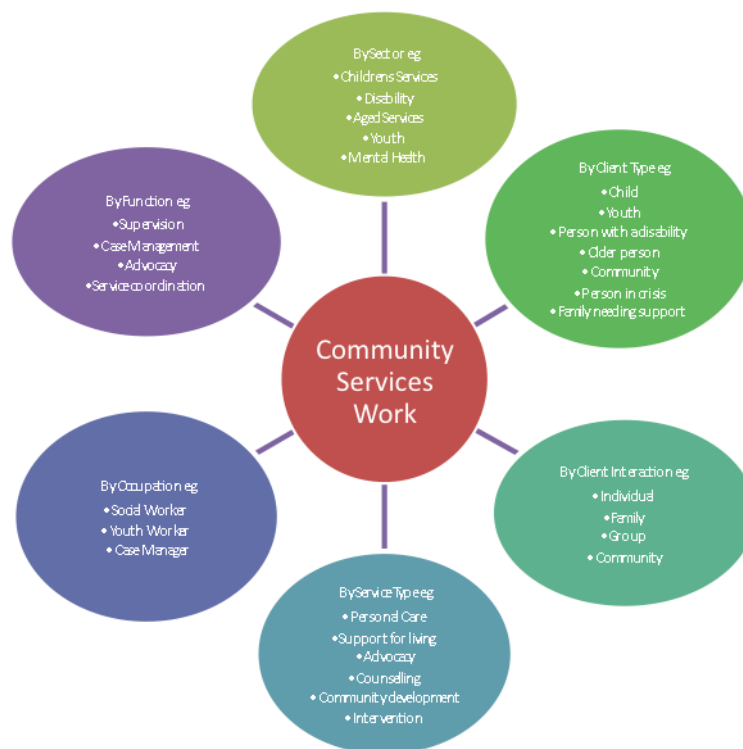
Diagram 1: classifications of community services work

The Community Services Training Package is designed to reflect the full range of services, modes of delivery and client profiles that are characteristic of the community services industry.